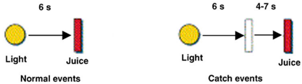
Figure 1. Classical Conditioning Task. Timing of events on normal and “catch” trials. On catch events, delivery of the juice reward occurs 10–13 second after the light cue, instead of the usual 6 seconds. During the training session (outside of the MRI scanner), subjects were presented only with the standard light-juice interval (6 s). During the MRI scanning session, catch trials were interspersed among the standard trials, representing approximately 1/4 of total trials.