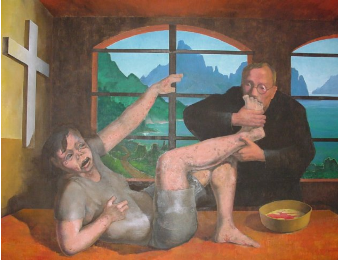
from Son Yangwŏn Moksa Sun'gyo Kinyŏmkwan (Pastor Son Yangwŏn martyrdom memorial hall), Yŏsu Aeyangwŏn