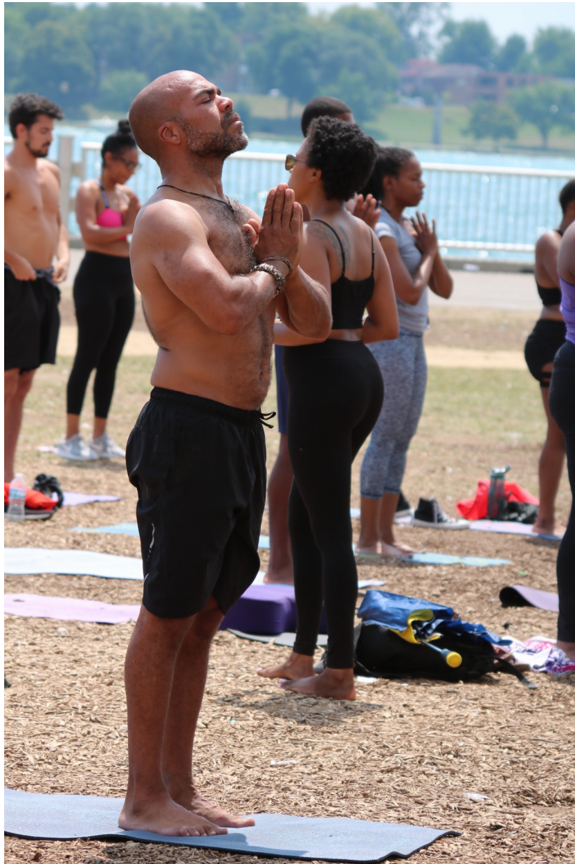
Figure 3 – Teaching a Free Community Class at Charivari, the Annual Detroit House Music Festival Held on Detroit’s Riverfront.

our mission? Absolutely not. That same week we were lucky to be called by Eastern Market 5 to offer classes there.