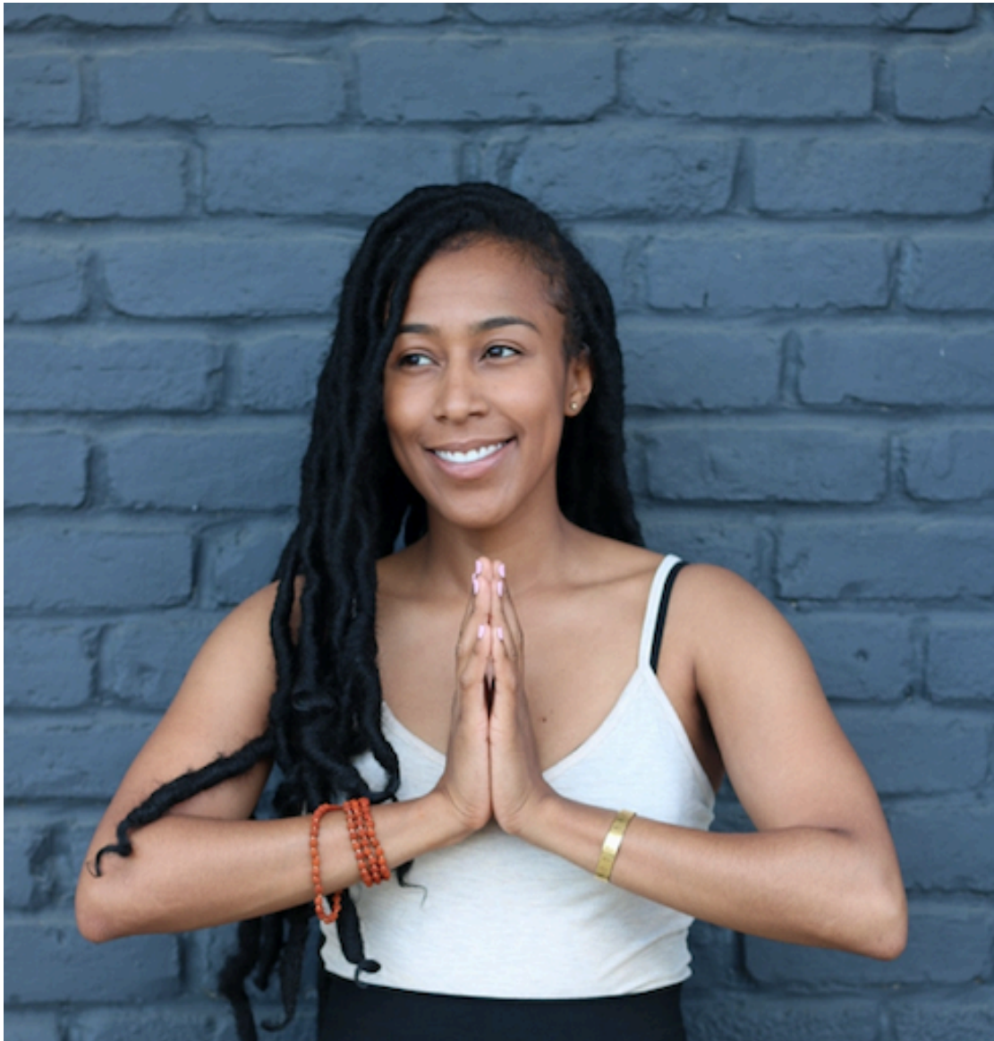
Figure 1 – Before Teaching a Class on the First Day of Summer to Celebrate International Yoga Day for Bumble at Trumbull and Porter-Detroit Downtown Ascend Hotel Collection.

alcohol and drugs, I was able to face it with mindfulness. Learning about the Yamas and the Niyamas definitely led me towards leaning into healthy ways to heal my heart and mind.