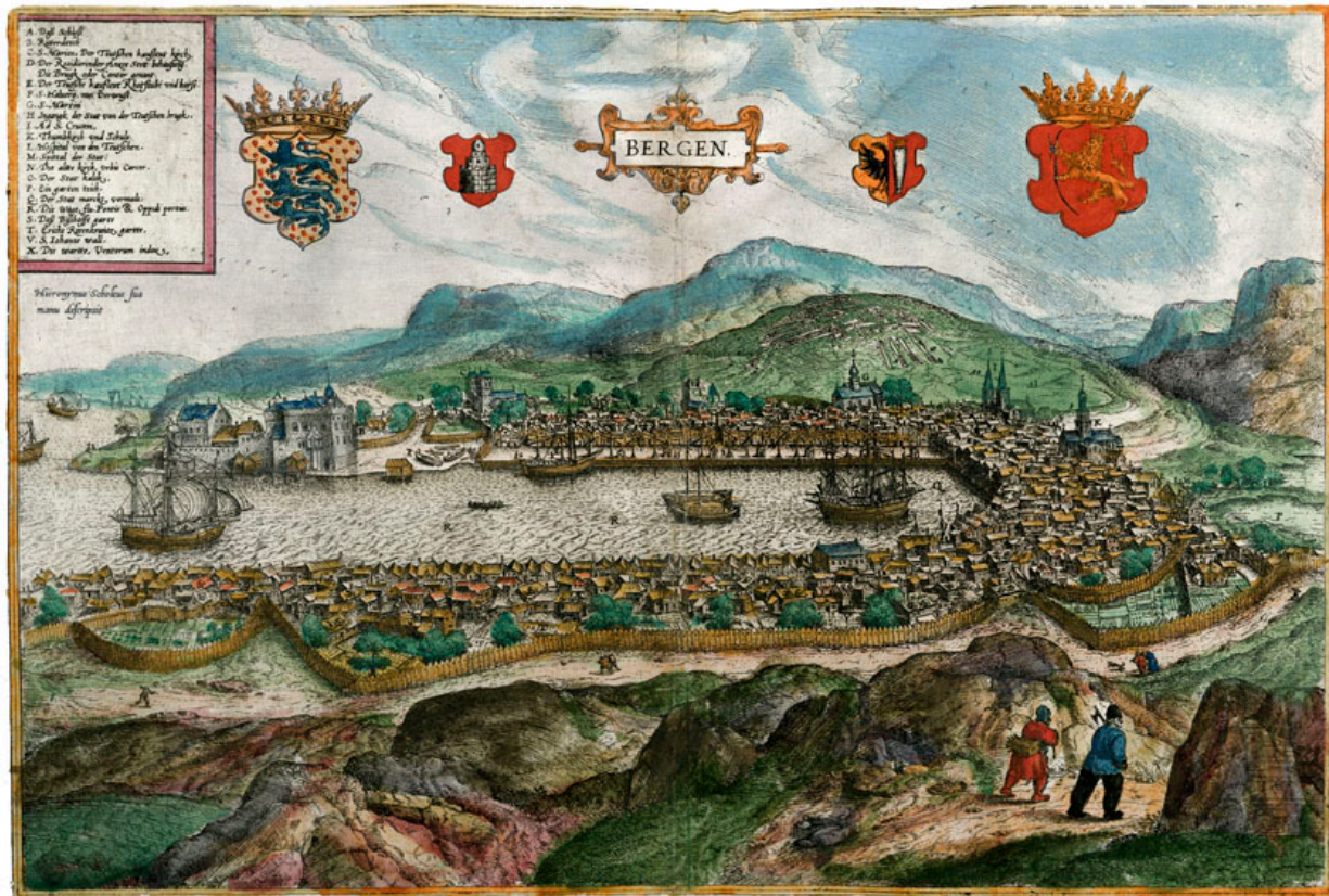
Figure 3 - This image of Bergen is from Civitates Orbis Terrarum , a four volume collection of maps and plans of world cities commissioned by a man named George Braun between the years 1577 and 1581. The wooden walls present in the late 1500s are clearly visible here. Haakon's Hall is seen on the north side of the fjord on the far left while Bergen Cathedral is found on the far right. 100 years earlier, as discussed in the paragraph above, the southern wall would have extended only as far the monastery in the south (the large building just below the largest ship on the right) and would have run a more even path from the cathedral to the monastery.

including the palace and its courtyards, while the estimated extended area after the walls were moved is only roughly thirty-five acres. The area of the entire island is only about eighty acres today, the water level having receded significantly. Bergen's medieval area (From Haakon's Hall to Bergen Domkirke and about one-third of the way around the southern edge of Bergen Fjord ) was closer to fifty acres.