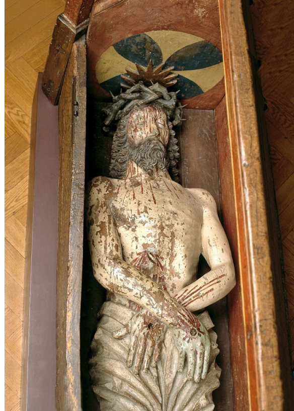
Figure 8 - Kerteminde kristigrav, Photo: Jesper Weng

The examples from Roslagsbro (Figure 9) and Enköping (Figure 10) in Sweden are both missing their original sepulchers and paint. They have been damaged but the style and pose of the Roslagsbro example indicates that it was used as part of the Easter rituals. As with the two Danish examples, the Västerlövsta example and the Bollnäs example, the figure is laying as if awaiting burial. The Enköping example is more difficult to identify as a kristigrav. His head droops and is tilted to right as is common in images of Christ on the cross. His arms are missing, making it impossible to tell their original position although his feet are not crossed and do not have the nails or nail holes that would be present in a crucifix. Historiska Museet identifies the style of the sculpture as a kristigrav as well (Enköping kristigrav, historiska.se ).