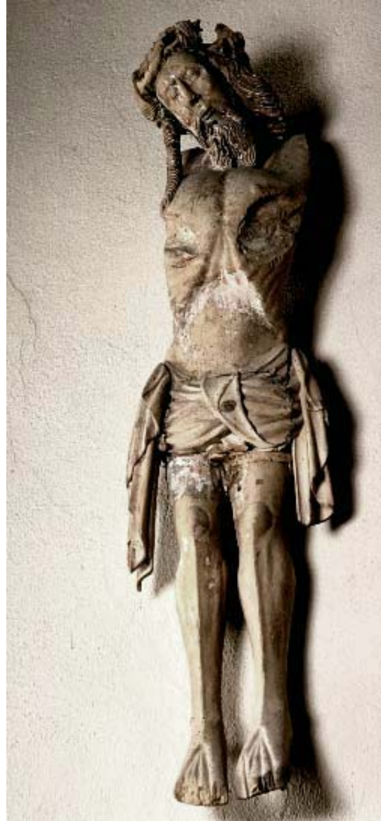
Figure 10 - Enköping kristigrav,