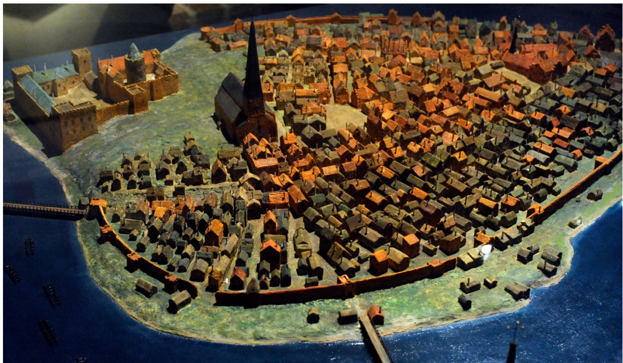
Figure 2 - The model of medieval Stockholm at The Medieval Museum. The wall on this model is the later wall. The buildings in the middle of the island (those that are more red in color on this model) would have been inside the earlier walls as described below. This image looks at the island of Gamla Stan from the northwest with now lost Tre Kronor fortress at the upper left (where the current Royal Palace is found). Model: Trygve Jerneman, 1962

including Söderköping, Linköping and Visby in Sweden and Copenhagen, Aarhus and Ribe in Denmark (Dahlbäck 1987, 57). Göran Dahlbäck estimates that fully one third of the population of Stockholm was German by the late middle-ages (Dahlbäck 1987, 52). In addition, the position of the city, quite literally, under the eye of the king, shows itself in the day-to-day operations of early city leaders. This fact has led scholars to believe that Stockholm was, in actuality, more under the control of the King than it was under the control of the citizens, the German merchants or the church (Dahlbäck 1987, 58).