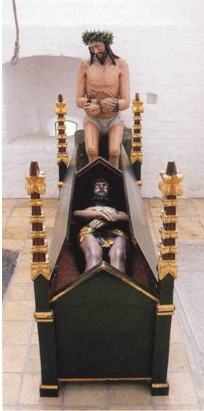
Figure 7 - Mariager kristigrav (and Smertensmand)