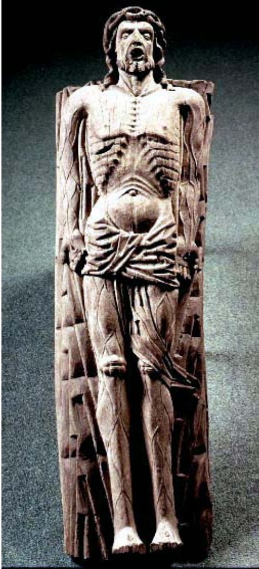
Figure 9 - Roslags-Bro kristigrav