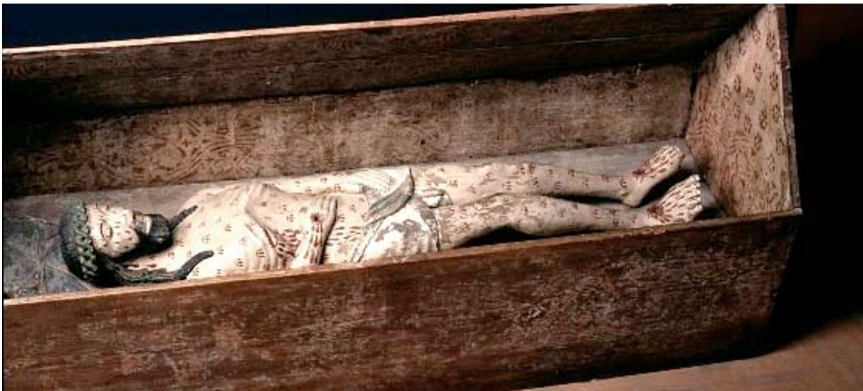
Figure 6 - Västerlövsta kristigrav