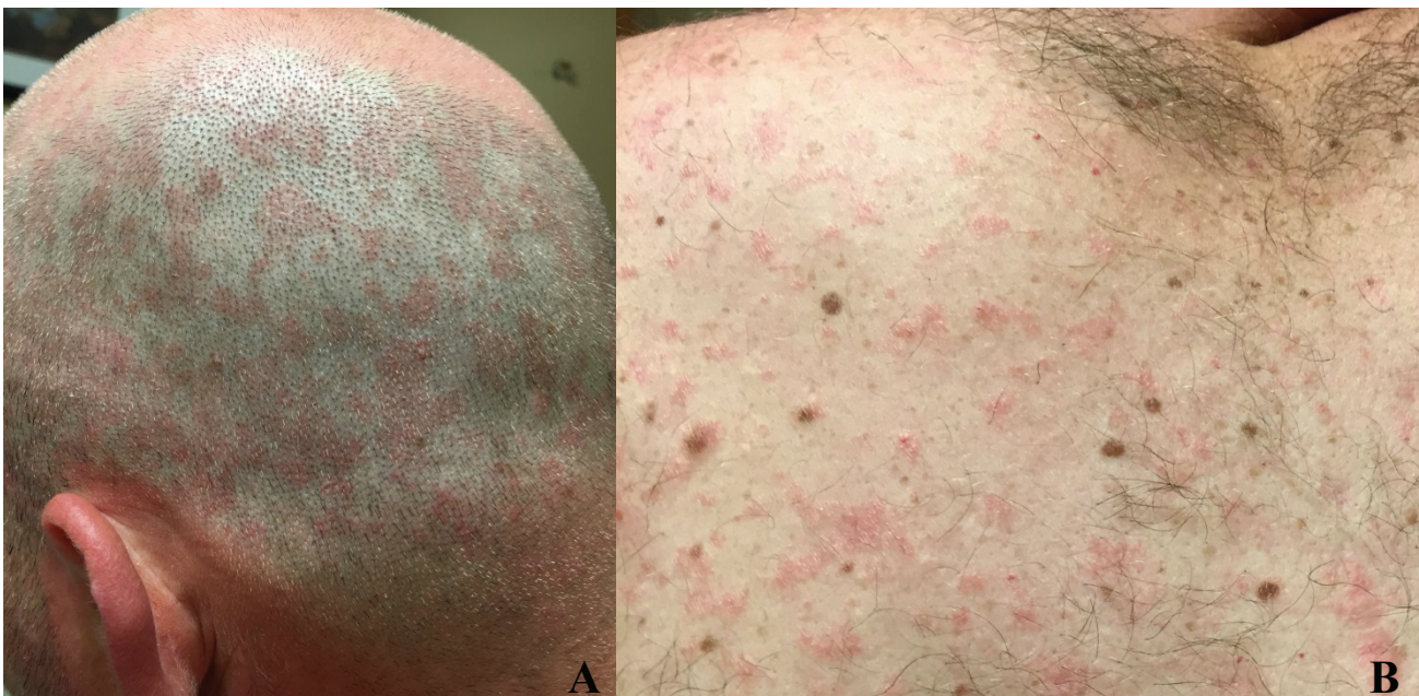
Figure 1. Guttate erythematous, scaly macules on the scalp (A) and upper back (B).

A shave biopsy was performed from a lower back lesion. Biopsy demonstrated regular psoriasiform epidermal hyperplasia, loss of the granular layer, and parakeratosis with neutrophils. There was a sparse perivascular lymphoid infiltrate surrounding dilated