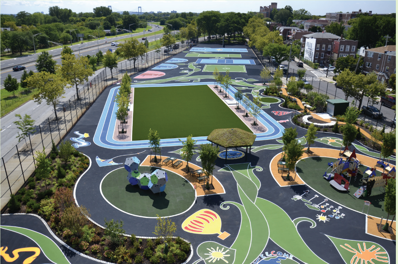
Figure 1. Greening non-traditional spaces: Public School 366 in New York City. (top) Before greening, the schoolyard was an uninviting expanse of deteriorating asphalt. (bottom) After the makeover, trees, play structures, tables, and other assets have transformed the space completely.