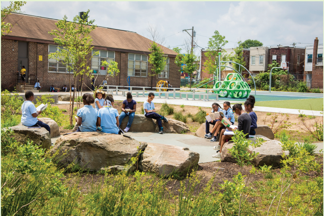
Figure 4. A student- and community-driven redesign of the outdoor space at Patterson Park Elementary School in Philadelphia has made it into a place used both during and after school.

(a) access, quality, and the community’s sense of belonging in public space is critical; (b) community must be at the center for the work; (c) partnerships facilitate multi-sector benefits.