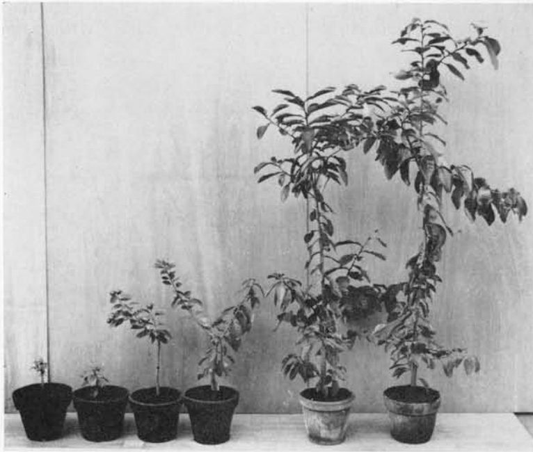
FIGURE 3. Severe stunting of grapefruit (left) and calamondin (center) seedlings that were inoculated by budding with buds from a diseased, field grown, calamondin tree. Noninoculated control plants are on the right.

A second trial on grapefruit and calamondin, using the same method of inoculation, produced similar symptoms, as in the initial test. All 5 inoculated (budded) grapefruit seedlings showed vein clearing, later