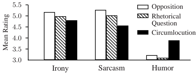
Figure 2: Mean ratings of irony, sarcasm and humor by sentence type.