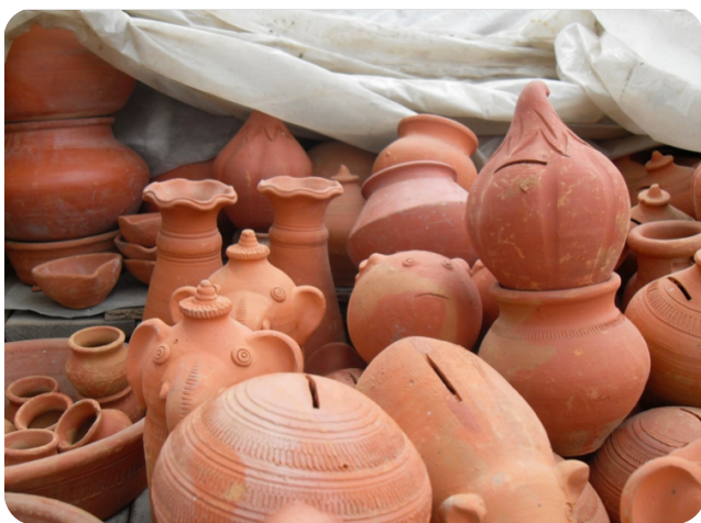
Fig. 1. Clay gulaks of different shapes and sizes in a Delhi market.

This study by IMTFI researcher Mani Nandhi looks into the impact of EKO's SimpliBank on the saving practices of low-income mobile money users in Delhi, India.