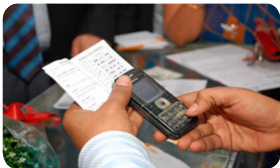
Fig. 2. EKO account combines mobile technology with affordable banking services.

Nandhi's study indicates that EKO accounts are a preferred means of savings and payments because of added convenience and safety at lower transaction cost (Case Study 1).