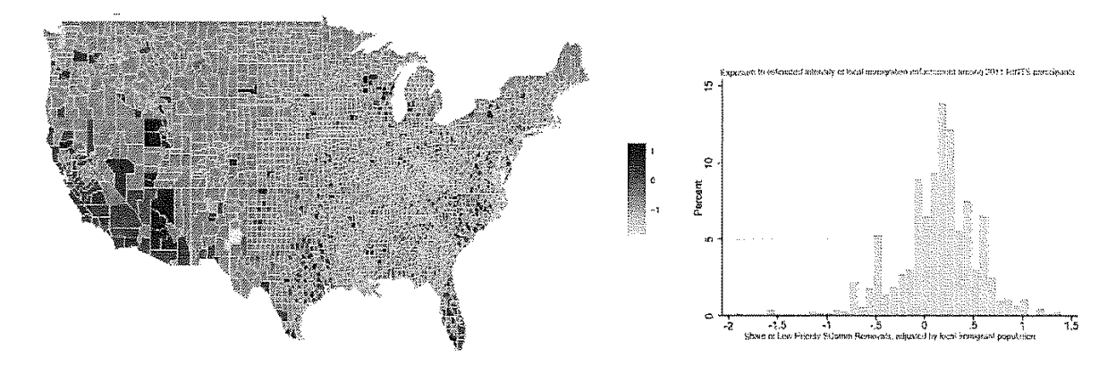
Figure 4.1 Secure Communities Enforcement 2011, Exposure among HINTS 4, Cycle 1 Participants.

et al. (2015) argue and find that deporting people who are classified as "low-priority," in particular, reduces general trust in the government.<sup>6</sup>