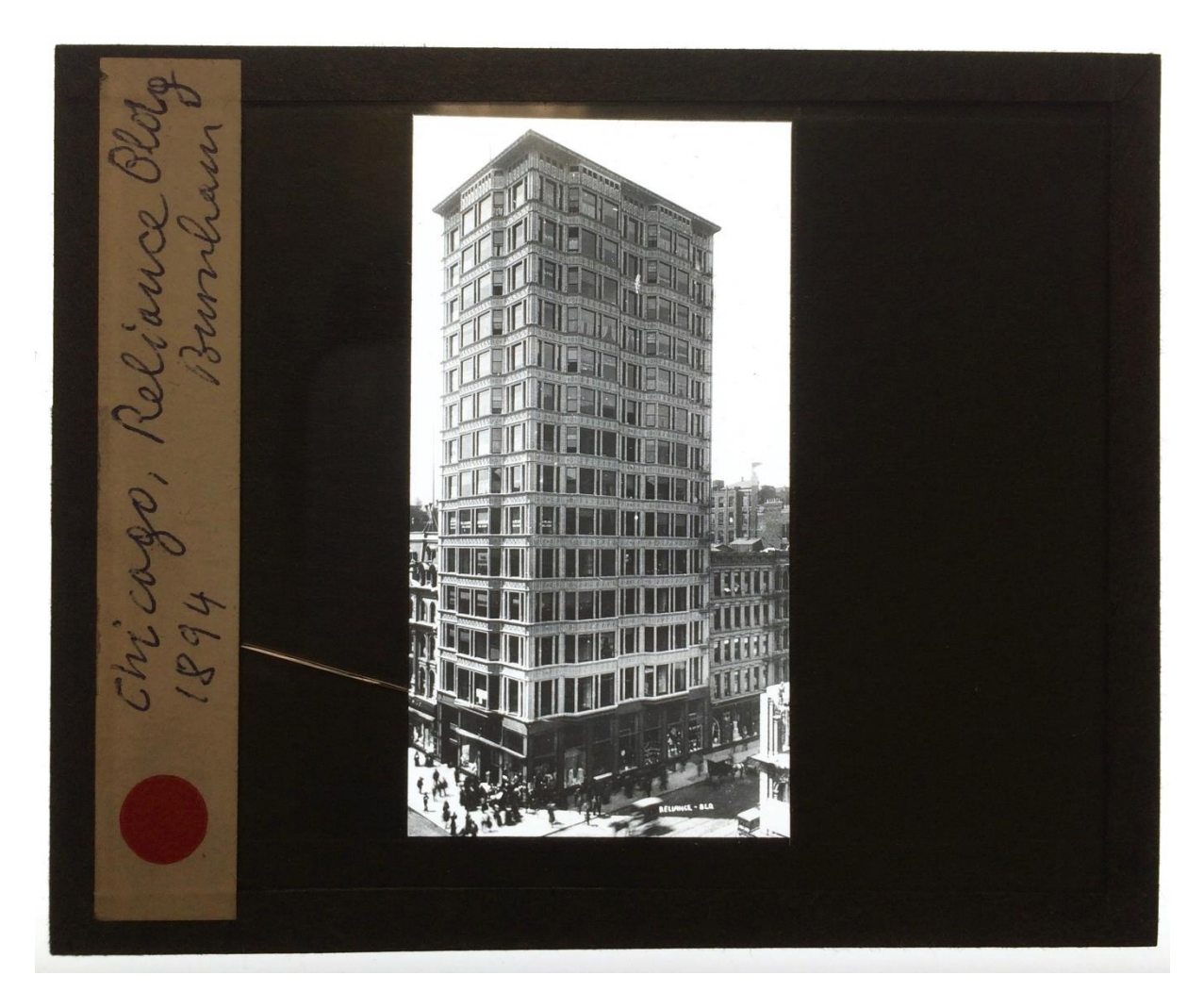
Illustration: Sigfried Giedion, "Chicago Reliance Building," lecture-slide. GTA Archives, Zurich, lecture slides box IV.